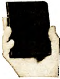
SAMPLE OF CLEAR, BLACK PRINT

and took counsel to slay them. 34 Then stood there up one in the council, a Pharisee, 41 ¶ And they de from the presence of council, rejoicing that were counted worthy t