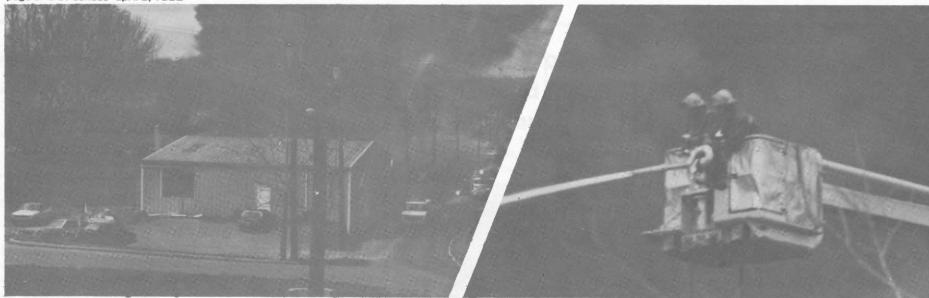
A spark from a torch set off a fire at Southern Oil Company which caused damage in the millions of dollars. Firemen battled the blaze for hours.