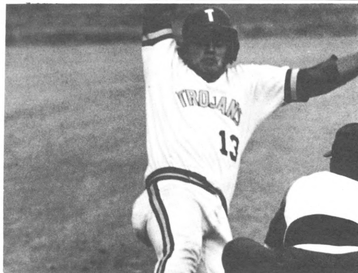
The Trevecca Trojan Baseball Team is on a hot streak with a 16-1-1 record going into last Wednesday's game with Lipscomb.