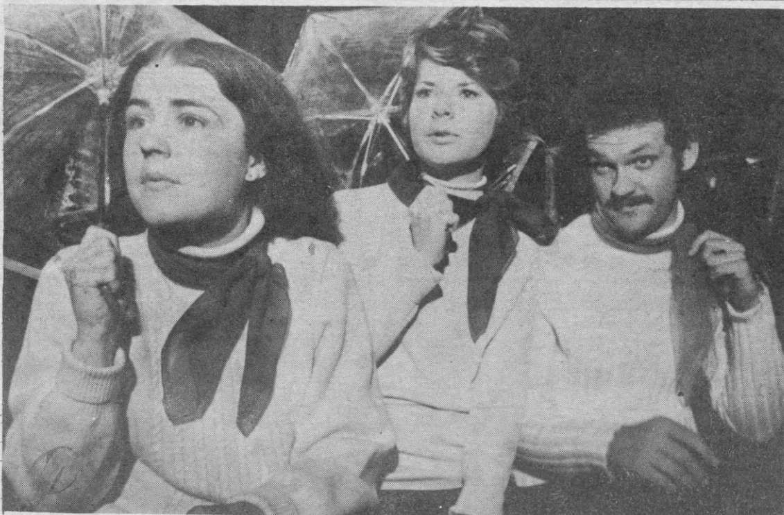
Pictured are three members of the Christian drama group, the After Dinner Players. The players will perform at Trevecca on March 25 at 7:00 P.M. in the McClurkan Auditorium.

The Junior Class is pleased to host the AD PLAYERS and encourage everyone to attend the performance. Admission will be $1.00 at the door.