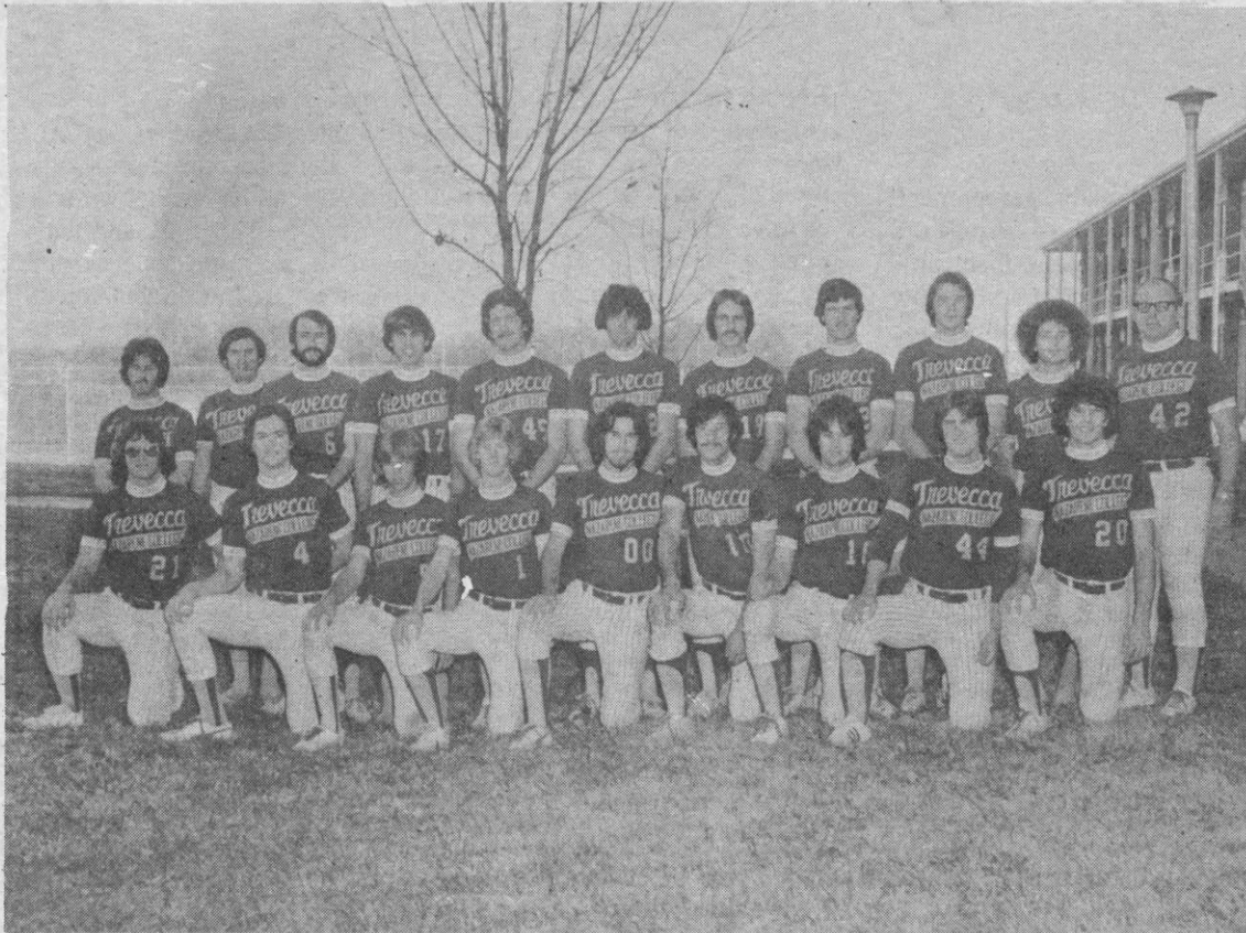
The 1976-1977 Trevecca Nazarene College Trojans.