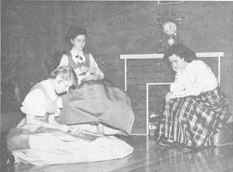
Junior Class Presents "Little Women," May 13

have a plan for your life, turn form curtains with the initials ties of the Fine Arts Departto Isaiah 30:18.