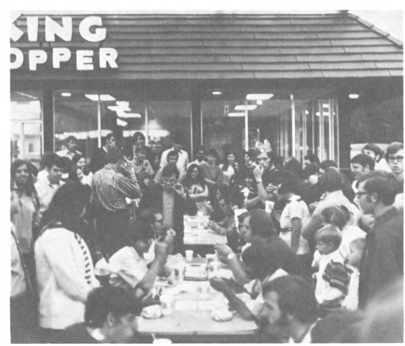
Action at the Whopper Contest!