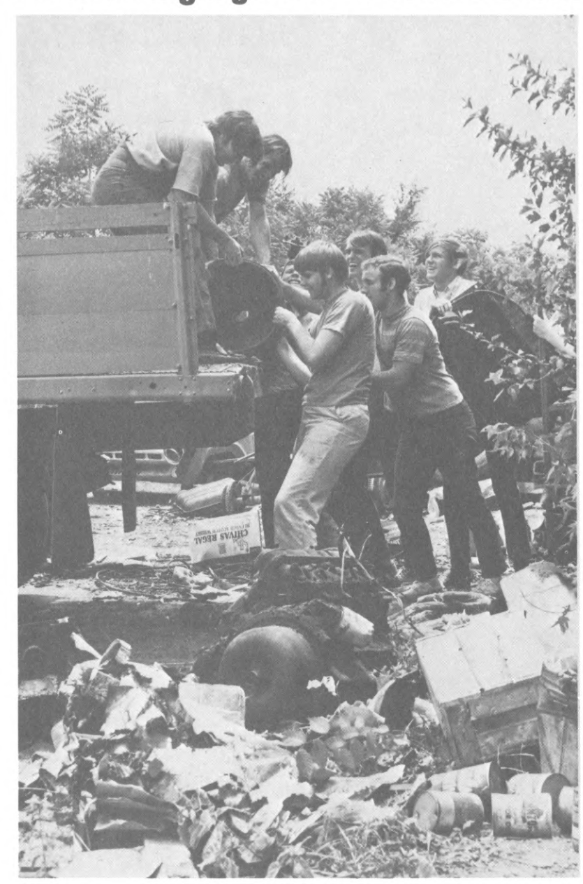
Sophomores and Circle K volunteers cleaning up the old Davis Property this past weekend.