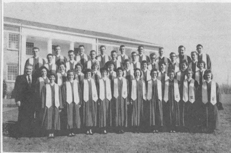
A Cappella Choir

Choir represented Trevecca College at Elizabethton, Tennessee; Charlotte, High Point, Greensboro, and Burlington, North Carolina; Roanoke and Arlington, Virginia; Elkins, Morgantown, Weirton, Parkersburg, Dunbar, and Charlestown, West Virginia; and Ashland, Newport, and Louisville, Kentucky.