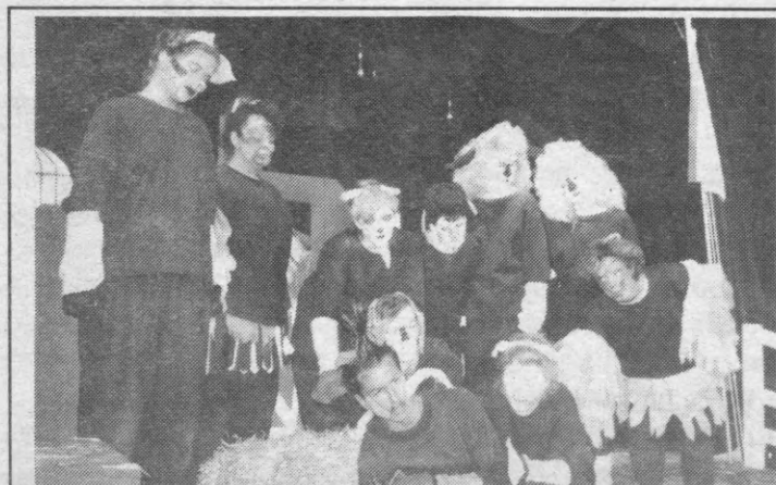
The animals look on as Boxer dies