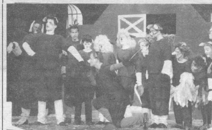
Minimus serenades the rest of the animals

Trevecca's Drama Department presented George Orwell's Animal Farm . Story on page 3