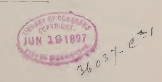
BOSTON THE CHRISTIAN WITNESS COMPANY 1897