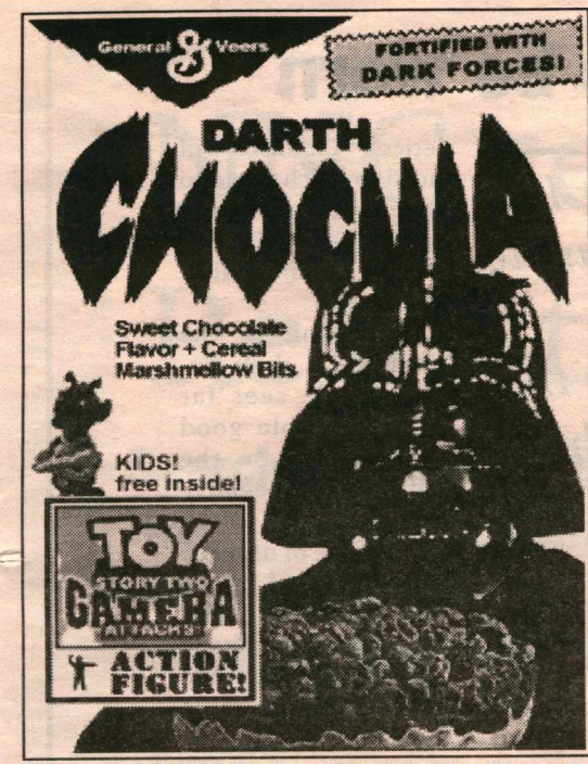
These products available at toshistation.com