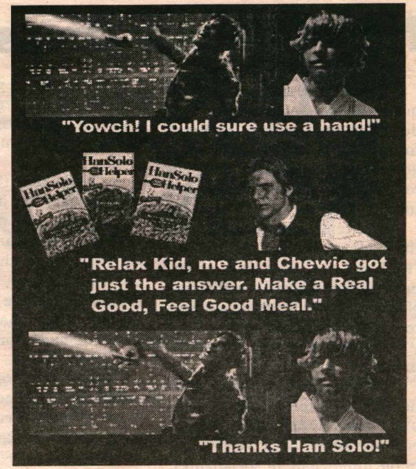
These products available at toshistation.com

Views expressed in The Inquisitor are thus more than likely those of Northwest Nazarene College and the Church of the Nazarene. We are a very selective forum for students, alumni, professors, faculty and anyone else associated with Northwest Nazarene College. Do NOT send letters. Remember, Big Brother is watching.