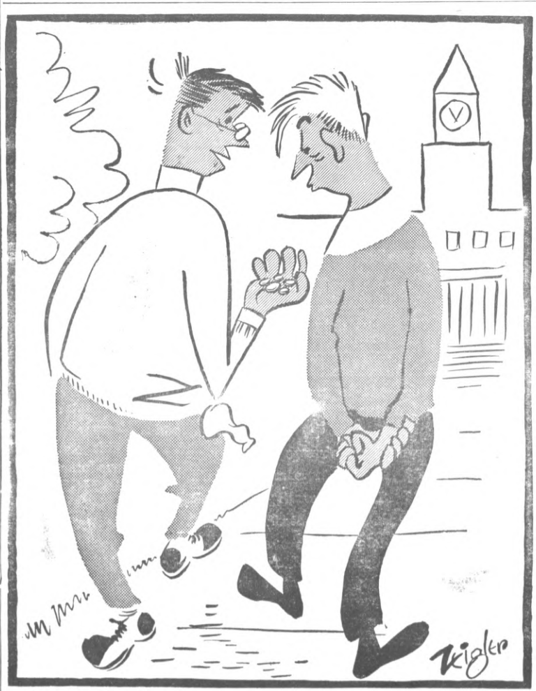
"Guess I'll ask Eunice . . . . she's on a diet."